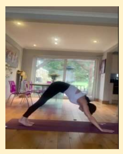
Downward-Facing Dog Pose

From Lizard Pose, bring your back knee to the floor and bend the knee, so your toes reach up. Extend your opposite arm back and take hold of your outer foot. Begin to twist your spine so your chest opens toward the sky. This pose can be done on the hands or forearms depending on your level of flexibility. Hold for 10 seconds.